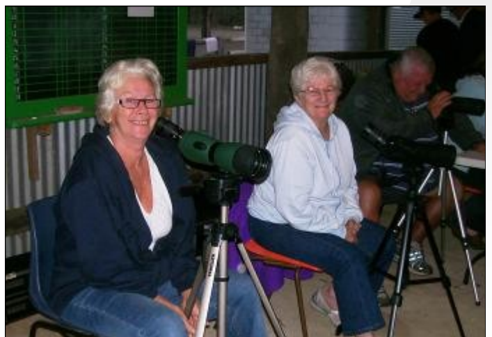
The range paparazzi out in force at the Wide Bay Champs.